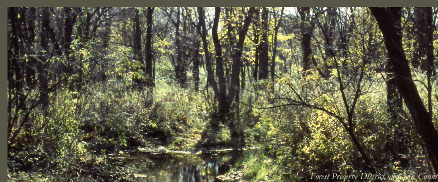
Forest Preserve District of Cook County

In winter, conditions permitting, the Camp offers a Nordic ski program. Lessons are available through certified instructors and trails are groomed for casual skiing. Ski rentals are available in sizes for all ages.