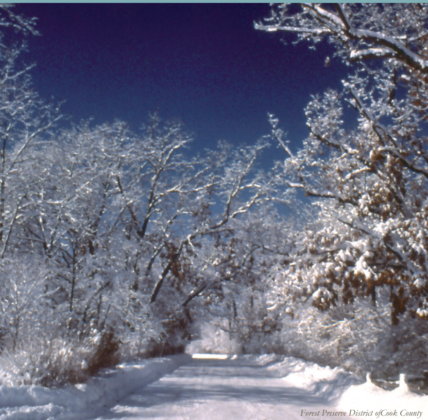
Forest Preserve District of Cook County